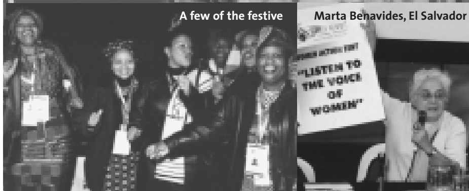
A few of the festive