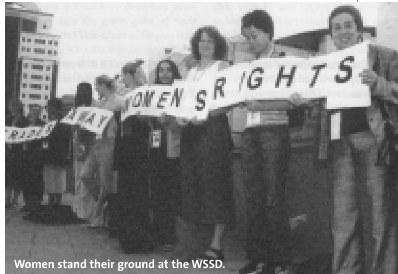
Women stand their ground at the WSSD.

Many of the NGOs attending the conference hoped that the ten-year anniversary of UNCED would serve as a wake-up call on a wide range of development and sustainability issues.