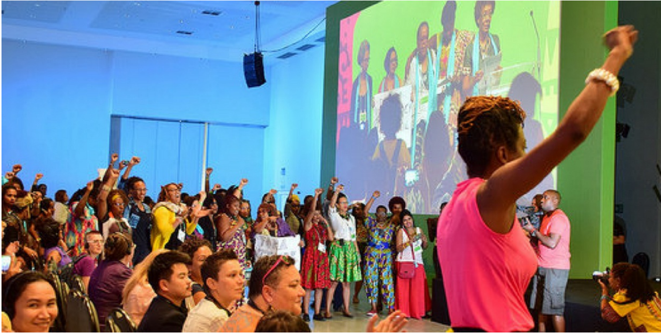
Building Collective Power at the 13th AWID International Forum