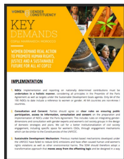
DOWNLOAD: The WGC's Key Demands for COP22