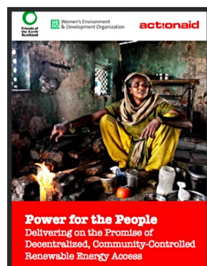
DOWNLOAD: Power for the People