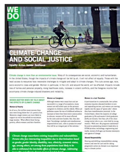
DOWNLOAD: Social Justice and Climate Change Factsheet