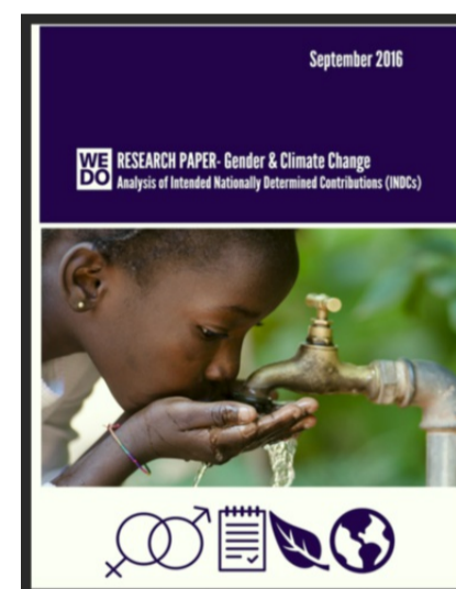
DOWNLOAD: Gender & Climate Change: Analysis of INDCS