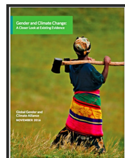
DOWNLOAD: Gender and Climate Change: A Closer Look at Existing Evidence