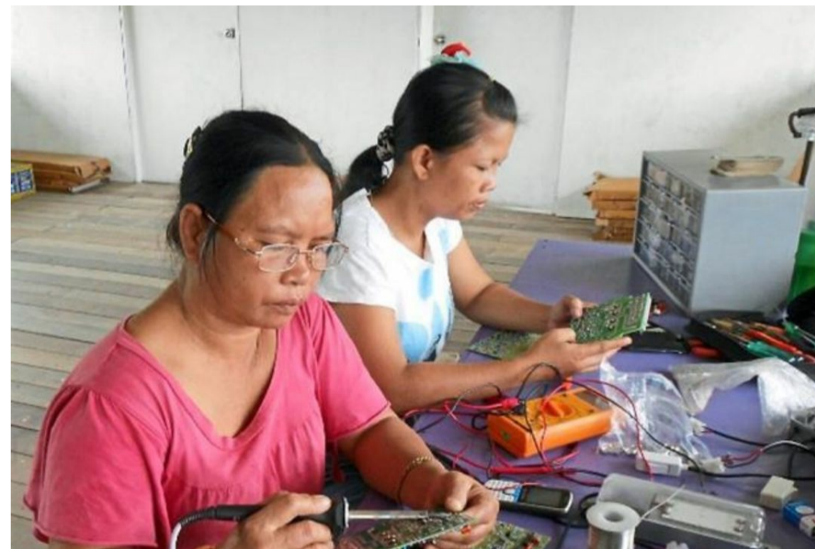
Meet Grandma, the Illiterate Solar Engineer (TheStar; 4 mins. read) - In a village in the interior Kota Marudu district of Sabah, a 47-year-old illiterate grandmother and rubber tapper is now a solar engineer. Within five months of returning, some 100 homes in the village are now equipped with solar power thanks to Tarahing's newly-gained expertise.