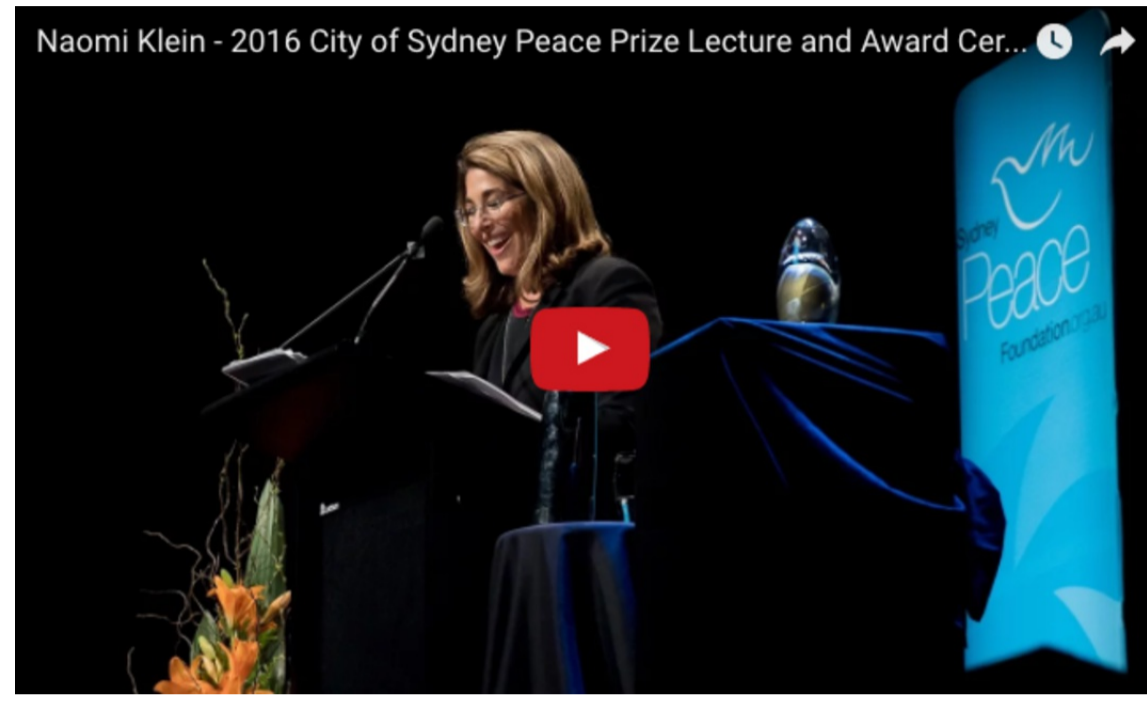
"Justice here and now is the only thing that's ever motivated popular movements to throw heart and soul into struggle," Naomi Klein delivering remarks upon accepting the Sydney Peace Prize.