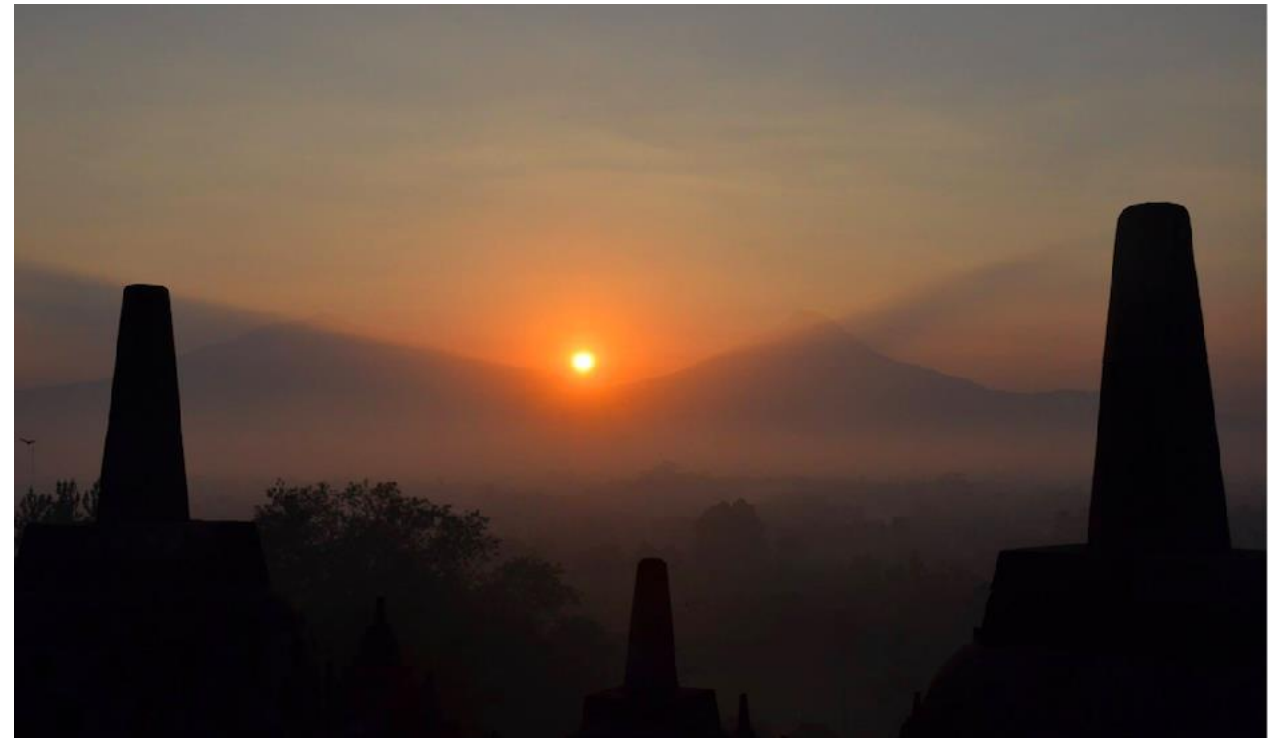
Sunrise between Merapi and Merbabu volcano complex in Central Java taken from the ancient Borobudur temple