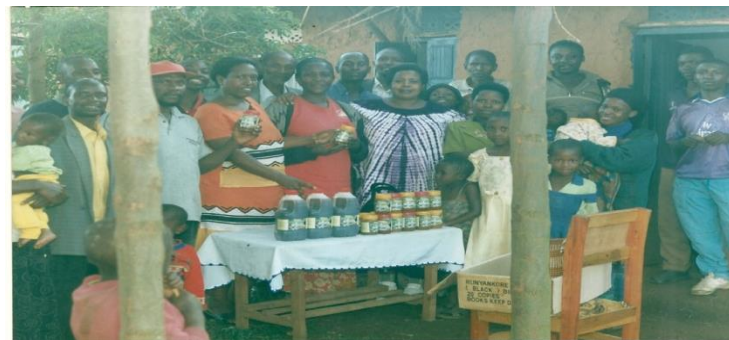
SWAGEN members triumphantly display their first honey harvest