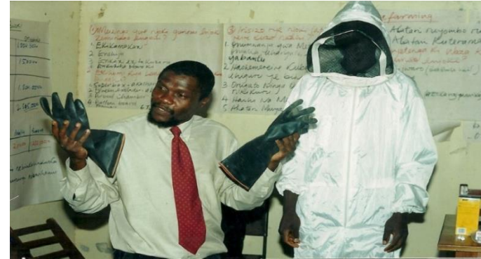
SWAGEN Members receive bee-keeping training